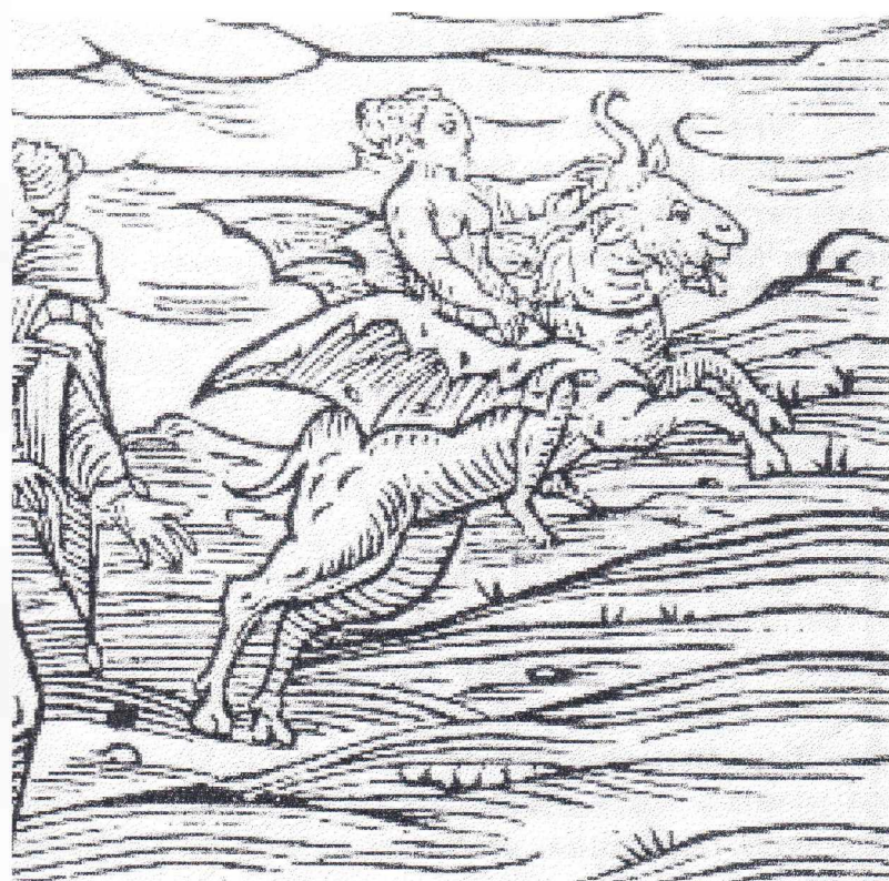
Witch riding a bewitched goat.

freedom and justice. Specifics seemed to be lacking. I wonder what the truth was that neither side wishes to tell.