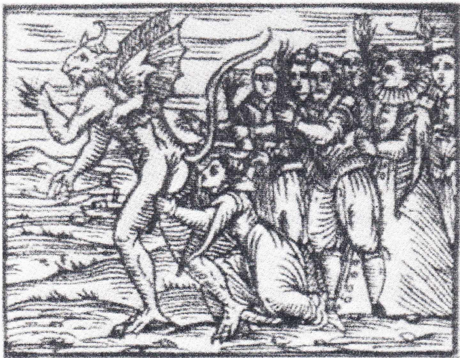
Witches kissing the Devil's Ass.

☛▲☛ No, I agree some of my best friends are _____. The only problem occurs when you have to wind them up.